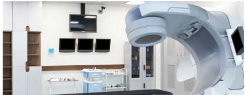
State-of-the-art equipment for diagnosis and treatment of cancer

The physical structure of Pakistan's largest tertiary care cancer centre was completed in late-November, 2022. Finishing work has commenced and the installation of equipment will be carried out throughout the coming year. The hospital will be equipped with the latest in technology for both diagnosis and treatment, and will be staffed by highly-qualified professionals. It is expected that the hospital will open at the end of December, 2023, Inshallah, when it will continue the tradition of our hospitals in Lahore and in Peshawar by providing state-of-the-art cancer treatment free of charge to the underprivileged.