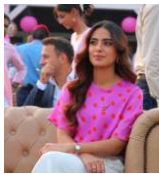
Iqra Aziz, TV actor and Shaukat Khanum Breast Cancer Awareness Campaign ambassador, attending the "Pink Polo" event, organised by SKMCH&RC, Lahore, in collaboration with Jinnah Polo & Country Club, to raise awareness about breast cancer.