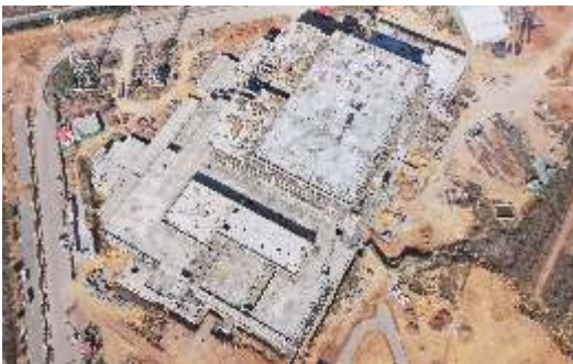
Constructed Area: 1 million sq. feet